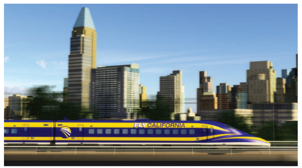
Conceptual view of high speed rail.